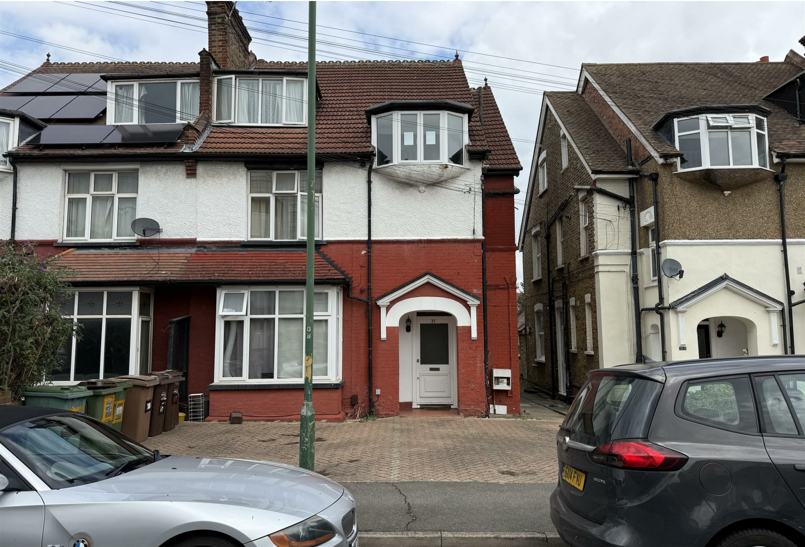
Belmont Road, SM6 8TE £850 Per Calendar Month